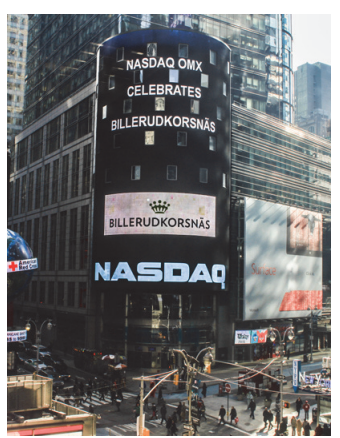
BillerudKorsnäs is listed on NASDAQ OMX Stockholm.