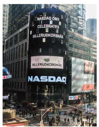
BillerudKorsnäs is listed on NASDAQ OMX Stockholm.