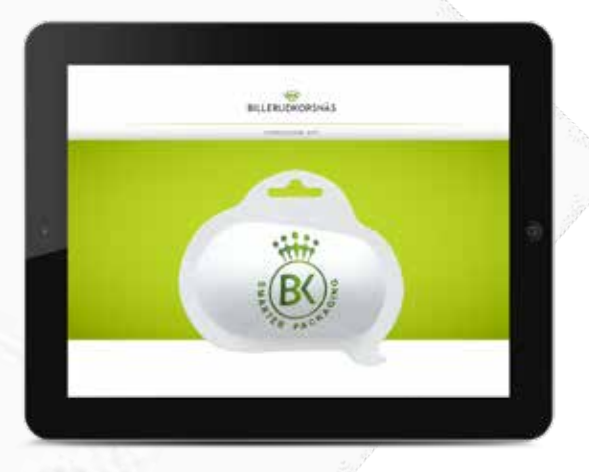
Want to experience our FibreForm app? Contact your local BillerudKorsnäs representative for a demonstration.

Structural design and knowledge-driven innovation that support new formable solutions. Focus on performance, food safety, brand expression and minimising material.